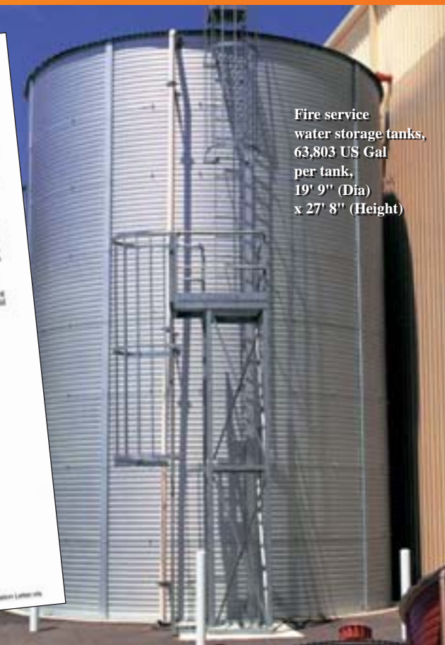
Fire service water storage tanks, 63,803 US Gal per tank, 19' 9" (Dia) x 27' 8" (Height)