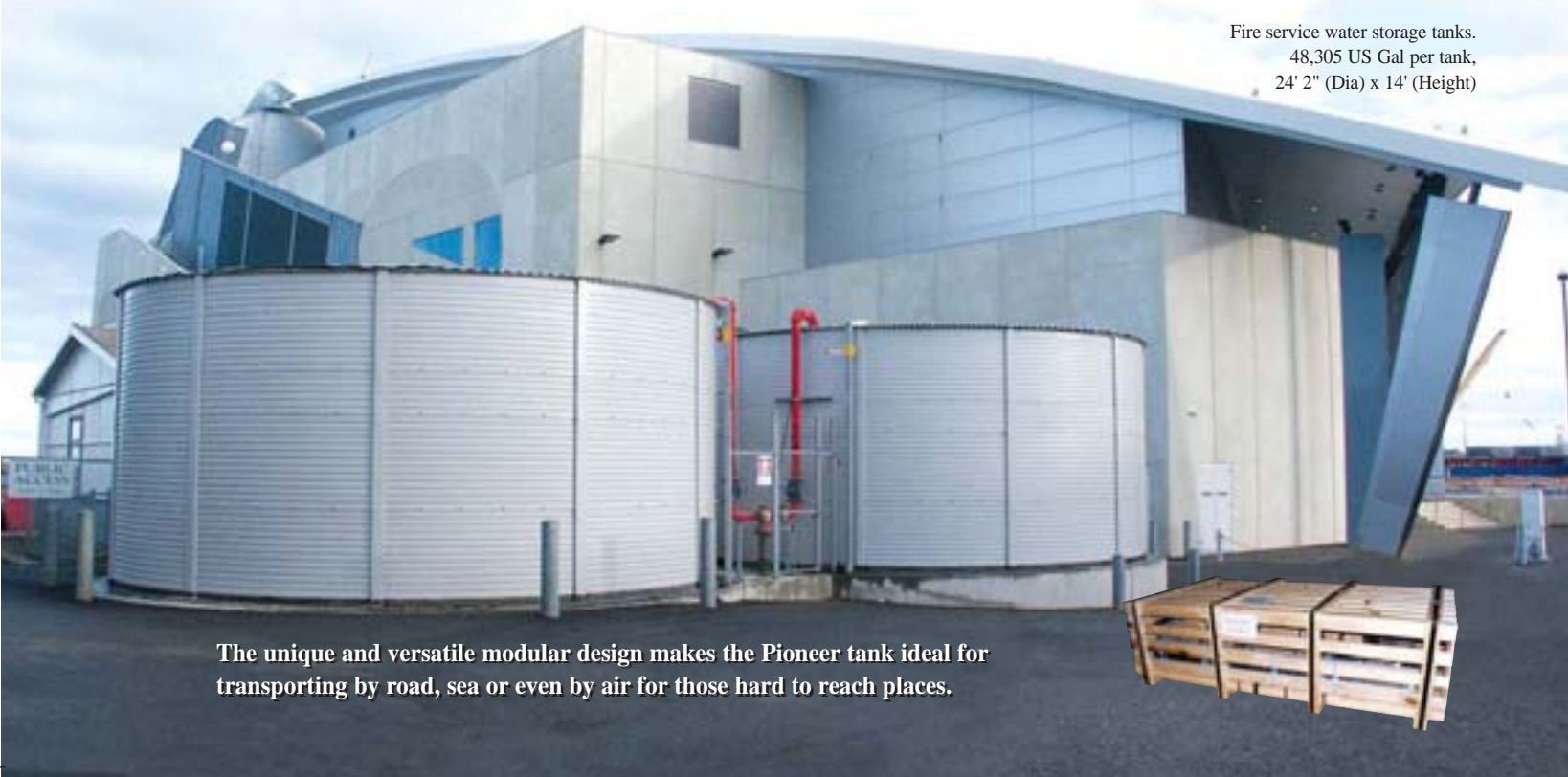
Fire service water storage tanks, 48,305 US Gal per tank, 24' 2" (Dia) x 14' (Height)

The unique and versatile modular design makes the Pioneer tank ideal for transporting by road, sea or even by air for those hard to reach places.