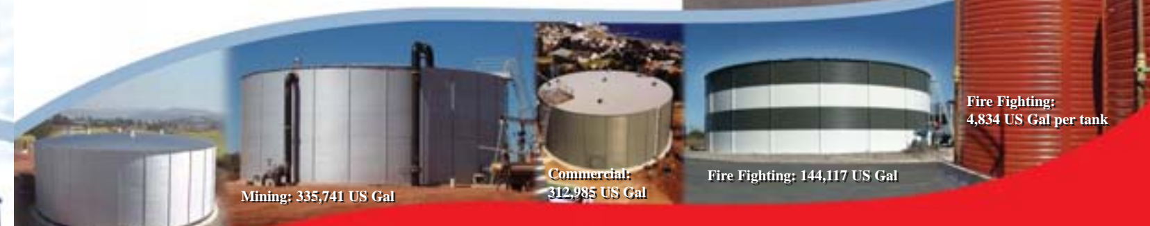
Commercial: 401,175 US Gal

The unique and versatile modular design makes the Pioneer tank ideal for transporting by road, sea or even by air for those hard to reach places.